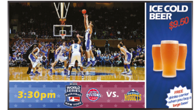
Display two full HD videos within digital signage with ArtioSign and AvediaStream m9405

Both the TV and connected player can be controlled from a single remote control, and screens can be managed centrally via the Smart Control app on AvediaServer. Simply connect and play: with automatic channel discovery and cost-effective Power over Ethernet (PoE), our robust players enable a quick and reliable path to an exceptional video experience.