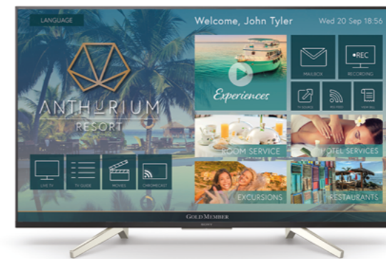
Display 4K video within ArtioView interactive IPTV portals, using the m9400 Media Player

Create dynamic digital signage with ArtioSign and display on any end-point via a connected media player. Several models come with 32GB of storage capacity, which enables delivery of hours of media-rich digital signage campaigns, including video content up to 4K resolution.