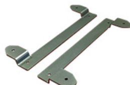
Wall Mount Included