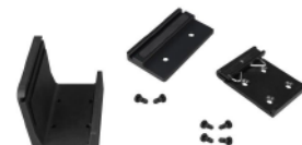
Din Rail Mount Sold Separately