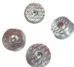
Desktop Mount Pads Included